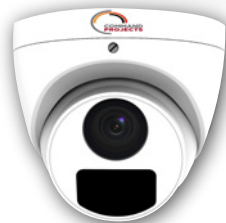
5MP night & day mode camera